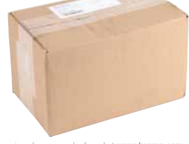
• • • • • All packaging units for RS-type pipe clamps can be found at www.kramp.com