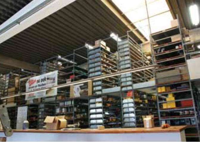
↑ An extensive warehouse ensures fast service and direct delivery, thus minimising downtime for Beel's customers