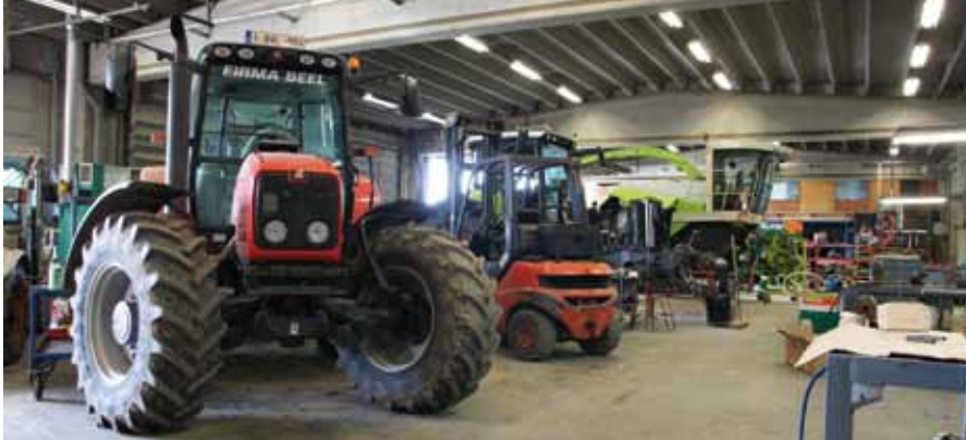
↑ The shop in Wortegem-Petegem stocks an extensive range of products for Forest & Grasscare maintenance

↑ Agricultural machines are getting bigger and bigger, which means that plenty of workshop space is required