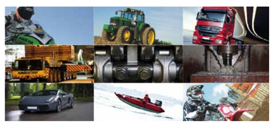
↑ Winning performances in motor sport.

Though famous for involvement in motor sport, Rock Oil's major activities are in the agricultural, automotive, commercial, foodsafe, industrial, marine, motorcycle and leisure markets. World Championship winning performances in motor sport have led to