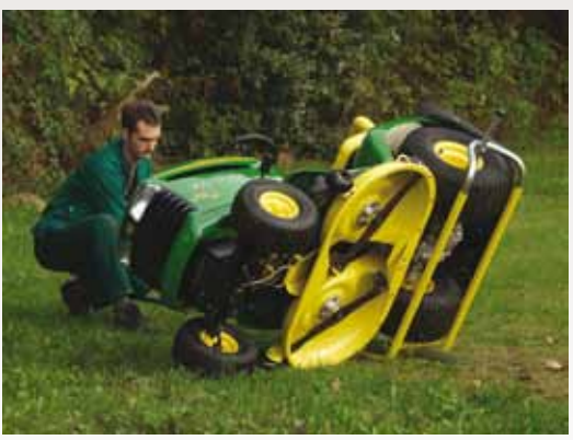
Cleaning mowers the easy way